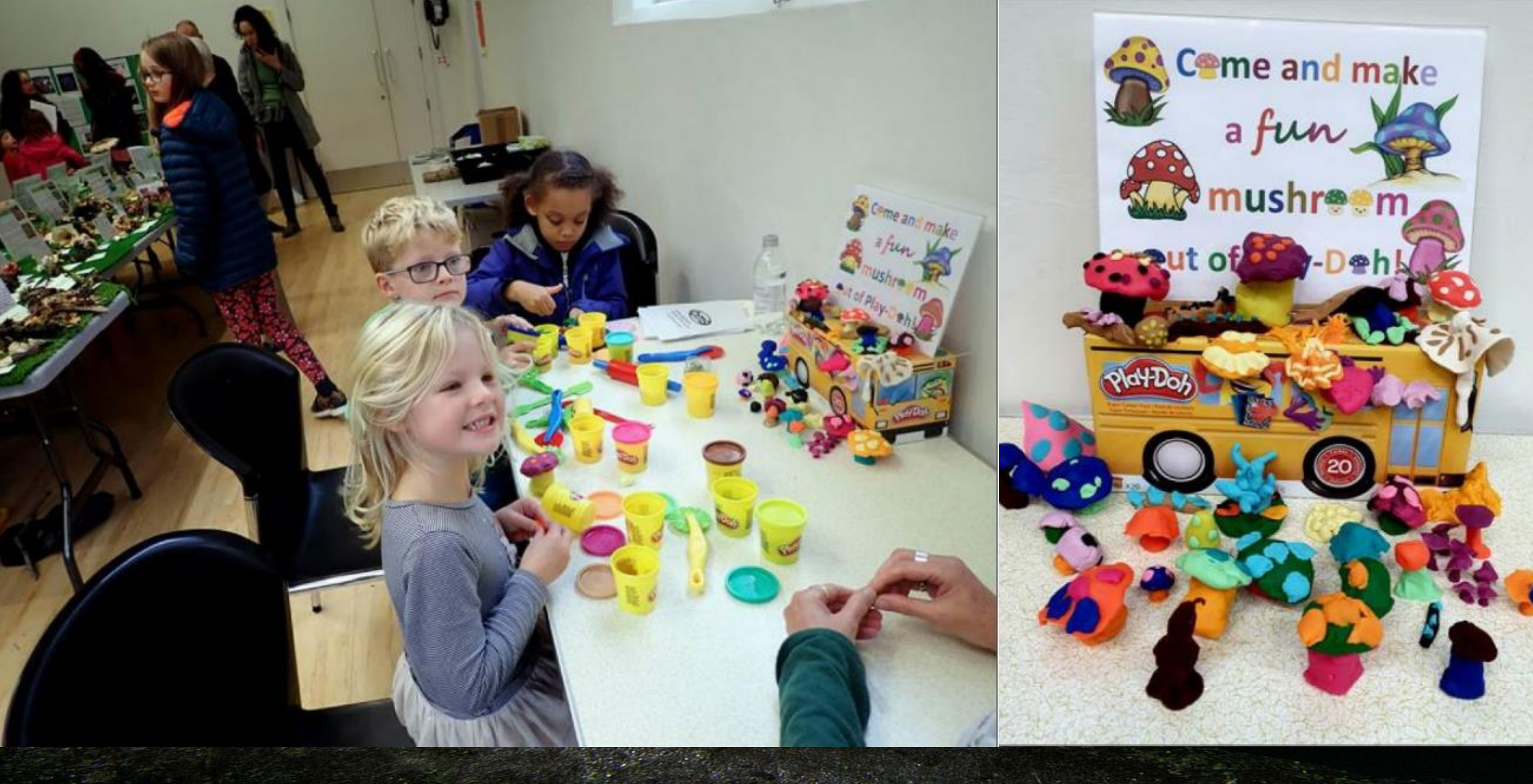
Aylesbury Museum National Fungus Day