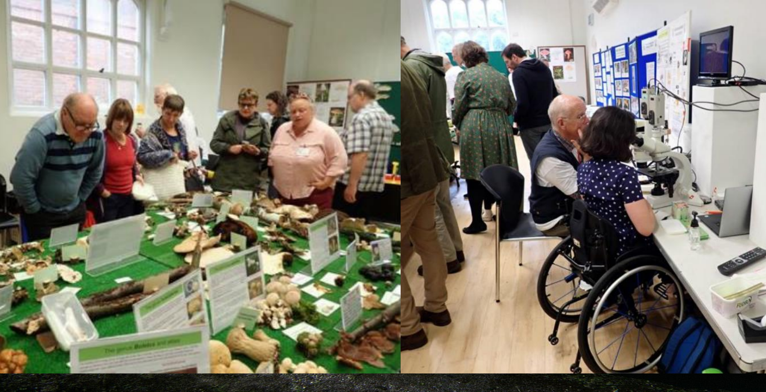
Aylesbury Museum National Fungus Day